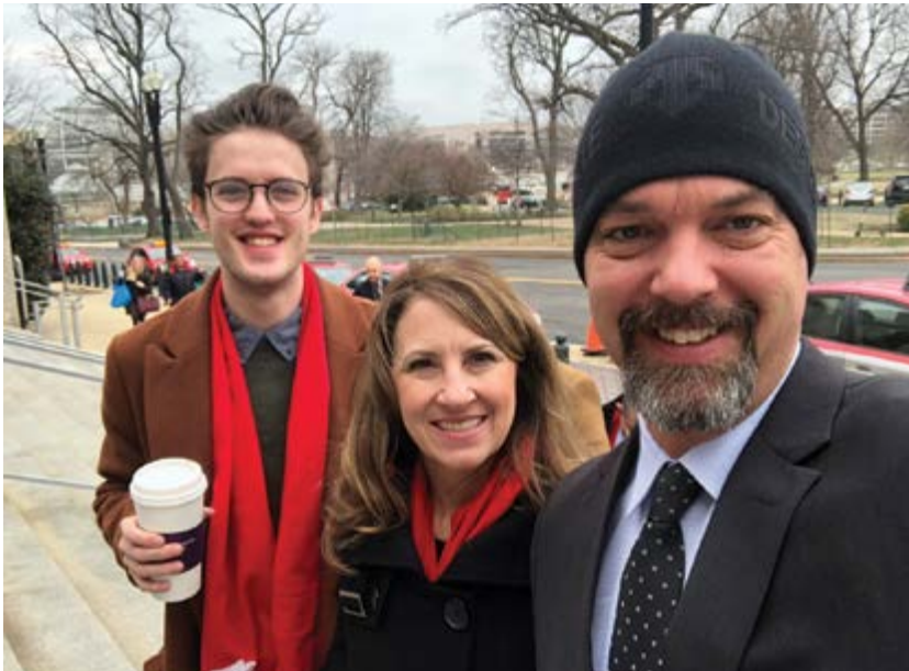
From the Executive Director